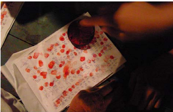
The Warriors of Qiugang still.02

More than 1800 Qiugang residents – almost the entire population of the village – signed a petition to local government leaders.