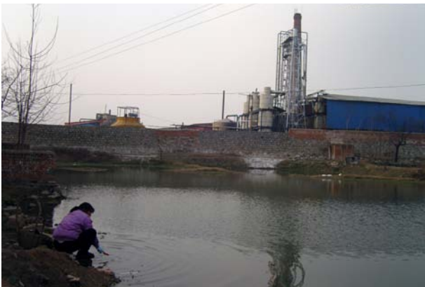
The Warriors of Qiugang still.03

Young woman wash clothing in a lake full of wastewater from the chemical factories.