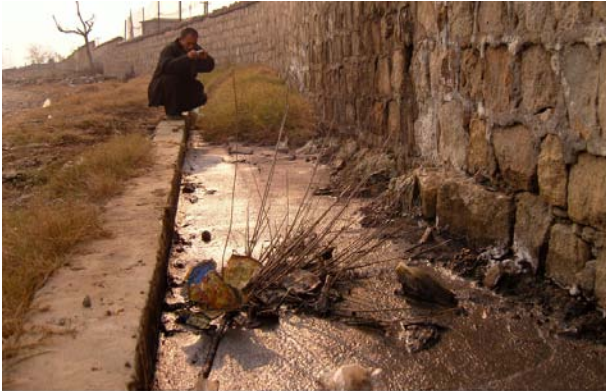
The Warriors of Qiugang still.01

Farmer turned activist Zhang Gongli documents the pollution from a chemical plant in the village of Qiugang, in Anhui Province.